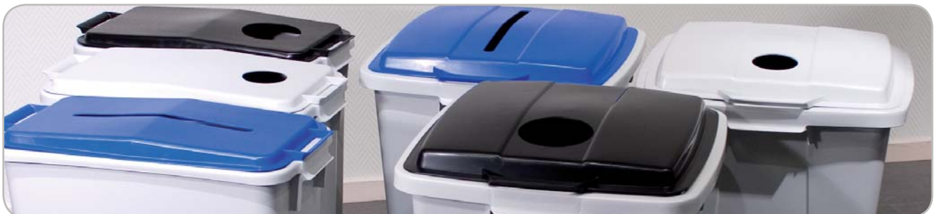
Special lids for recycling