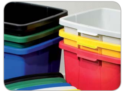
Approved for food handling