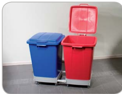
Wide range of accessories