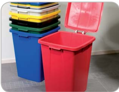
Can stand warmth and cold -5°C to +60°C

Multi purpose container 90 litre Stable container, suitable for environments where larger volumes of waste and recycling material must be taken care of