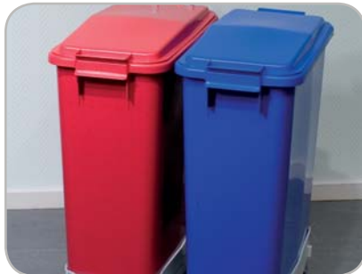
Easy to place because of its shape