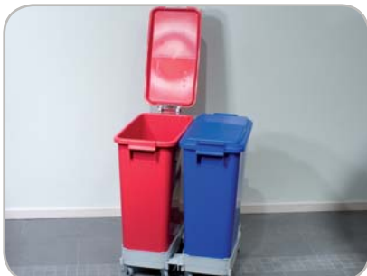
Wide range of accessories