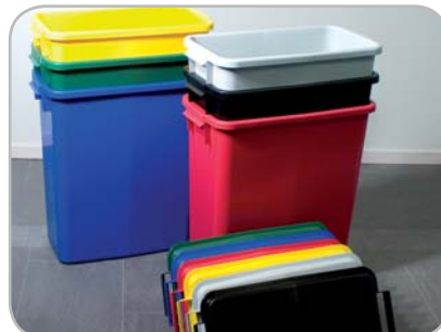
Approved for food hand- ling