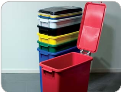
Can stand warmth and cold -5°C to +60°C

Multi purpose container 60 litre Practical, easy to place waste container. Suitable for recycling or as a large wastepaper basket.